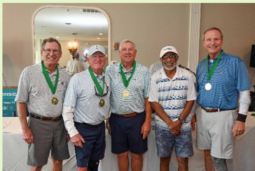
The Lucy Craft Laney Museum of Black History is a 501(c)(3) tax-exempt organization.