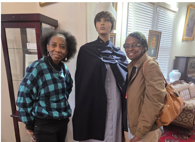
Retired Nurses visiting museum