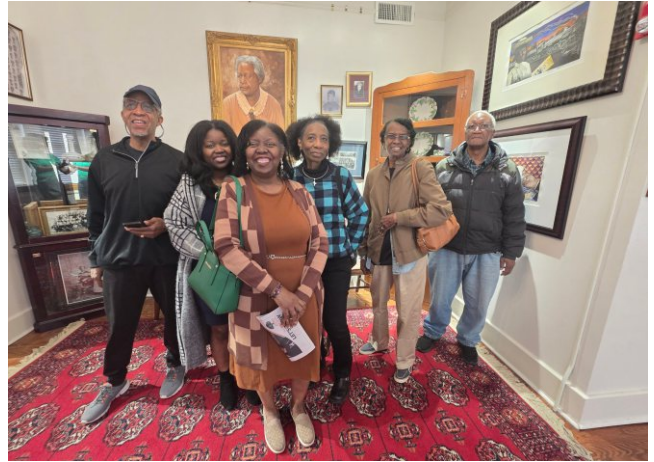
Museum visitors and retired nurses