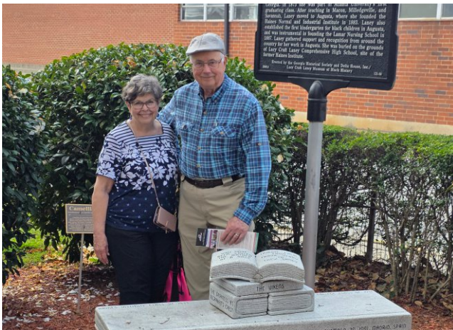
Museum Visitors From Out of State